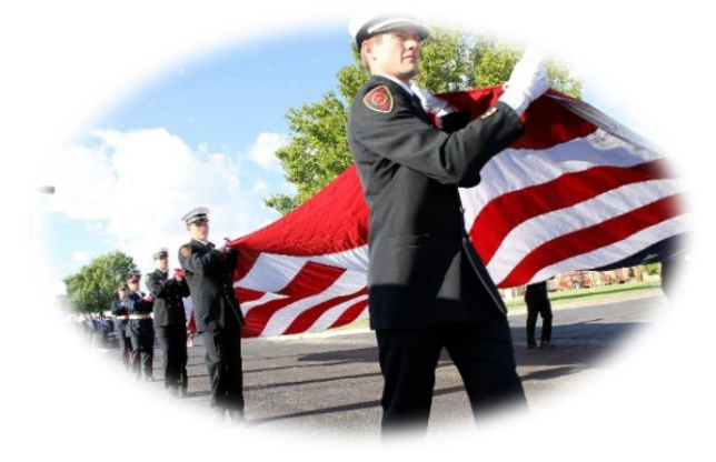
Dress for the day: Please wear your Class "A" Uniform or your Department's Best.

Join us at the Drill Tower as we honor the memories of all our fallen brothers and sisters in the New Mexico Fire and EMS Service.